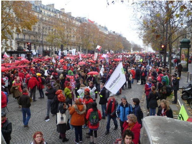
Demonstrators in Paris following the Paris climate agreement which promises to “pursue efforts” to limit the increase to no more than 1.5°C

Kevin Anderson of the Tyndall Centre for Climate Change Research said of the agreement “If the global community is to maintain emissions with the 2°C carbon budget, there needs to be much greater recognition of the profound and immediate challenges we face. The scale of emission reductions will not be delivered through eloquent speeches, win-win rhetoric and green-growth spin”.