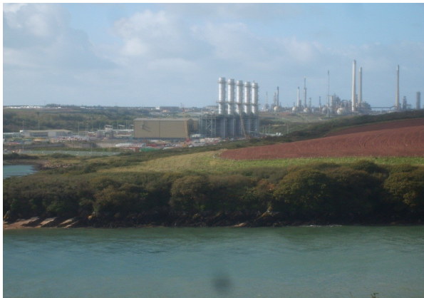
Pembroke power station with Valero oil refinery in background.