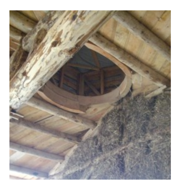
One of the roof lights under construction

http://www.lammas.org.uk/ecovillage/news.htm or take a look for yourself at one of their Open Days. These will be on each Saturday between 16<sup>th</sup> April and 16<sup>th</sup> July.