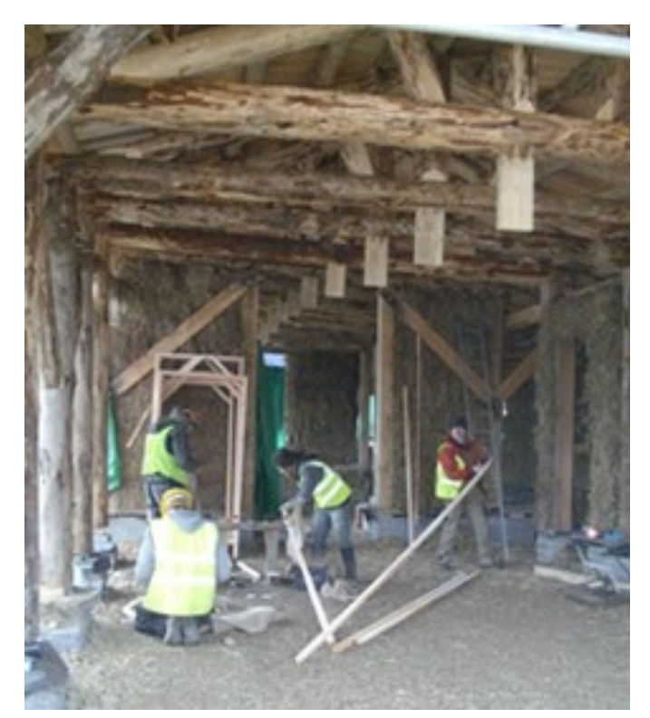
Volunteers building straw bale walls

Covanta's application is one of the first to be considered by the new infrastructure Planning Commission(IPC), making it harder for local people to be heard and to challenge decisions. The IPC does not look at the impact on Climate change.