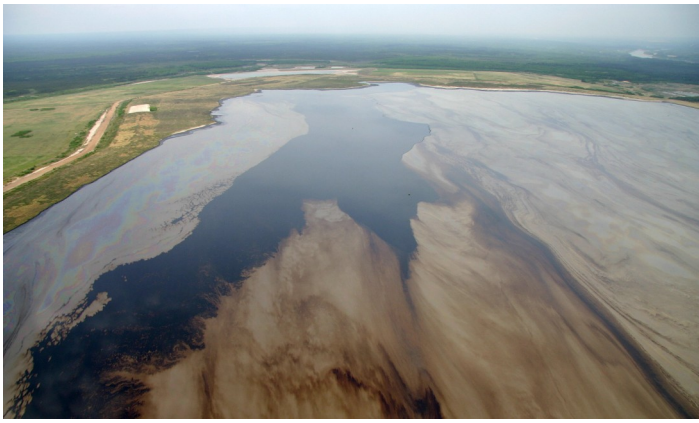
Lakes of toxic pollution which slowly leaches out in the surrounding water courses .