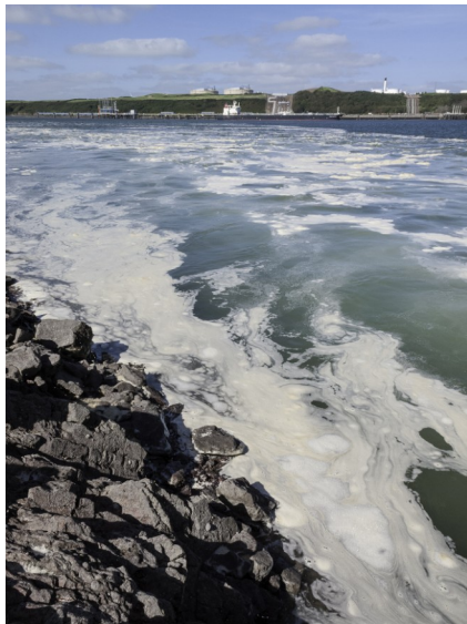
Outfall foam from Pembroke Power Station September 2012

This decision means that the UK government will now have to demonstrate to the EC how it can reduce the environmental harm caused.