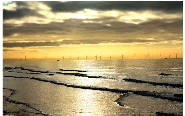
Photo of Mersey offshore windfarm, winner of FoE Clean British Energy photo competition

"Offshore wind power is increasingly attracting investors," said Christian Kjaer, chief executive of the European Wind Energy Association. "Offshore wind power creates jobs in Europe, reduces our fuel import costs, and avoids the global and local health and environmental costs of extracting, transporting and burning fossil fuels," he said. Positive News 5th Oct